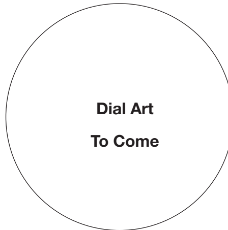
Dial in Accordance with EN 837-01