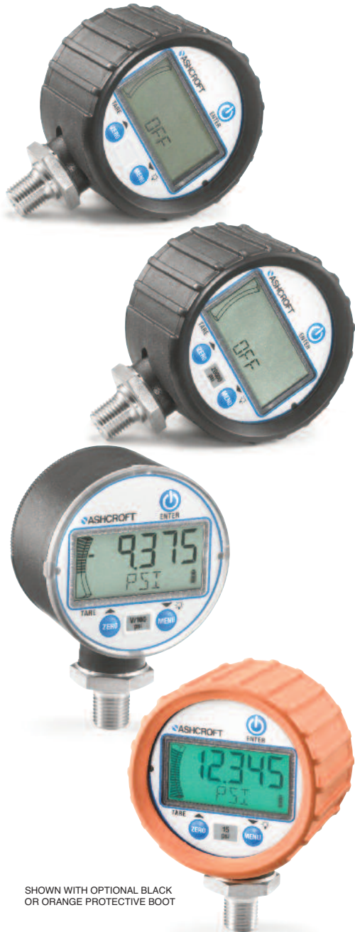
SHOWN WITH OPTIONAL BLACK OR ORANGE PROTECTIVE BOOT